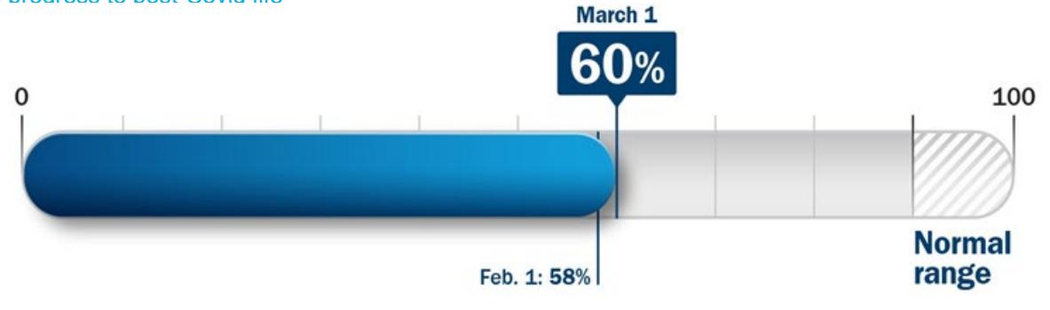
Figure 1: The Return to Normal Index tracks activity compared with pre-pandemic levels as we progress to post-Covid life