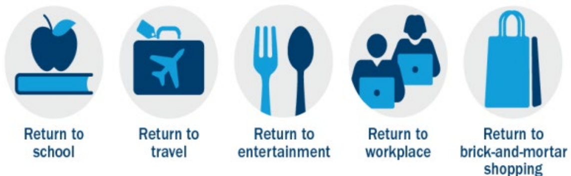
Figure 2: Tracking inputs

Our index suggests we're still 20% below pre-Covid activity levels. The levels of component activity vary: the return to brick-and-mortar stores is 13% below its pre-Covid levels and a normal work routine is 19% below pre-Covid. Travel and entertainment activity has recently had a stronger recovery, but it continues to lag other categories at 23% below pre-Covid levels. The return to school data may not see a meaningful gain until the fall – as long as a return to in-person schooling is more widely implemented.